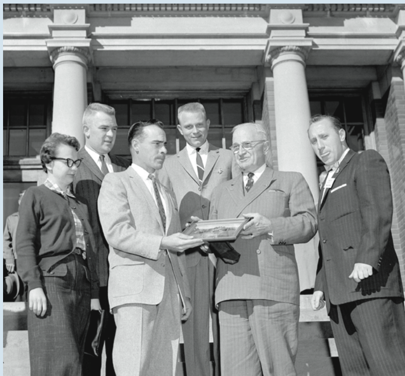
1958 Harry Truman on the steps of Old Main.

A large number of male students were drafted in early WWII. Women celebrated the return of men to campus with the arrival of V-12 cadets.