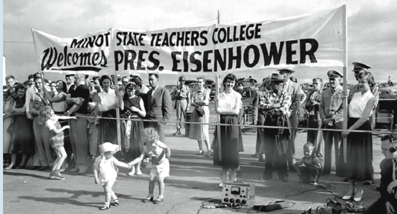
1953 Minot State Teachers College welcomes President Eisenhower.