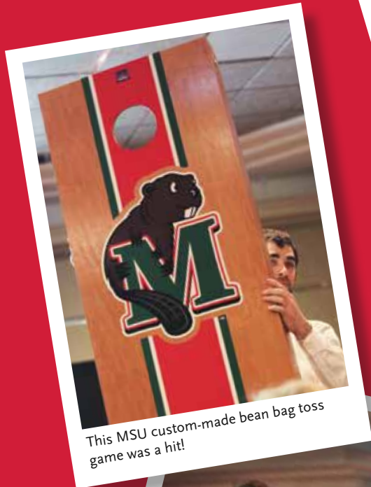
This MSU custom-made bean bag toss game was a hit!