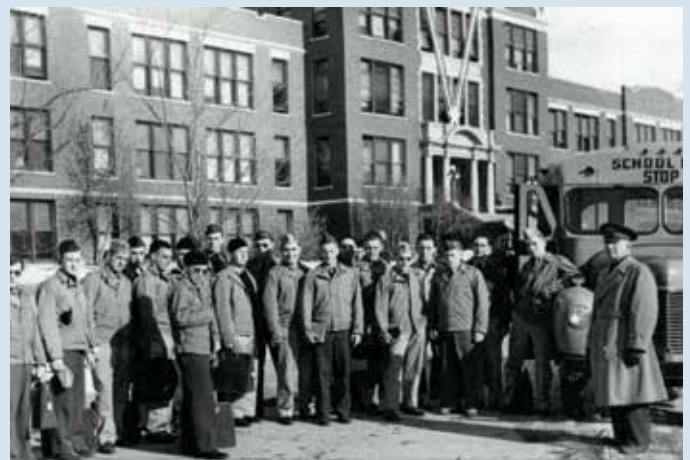
V-12 recruits arrive at Minot State to begin their Navy training.