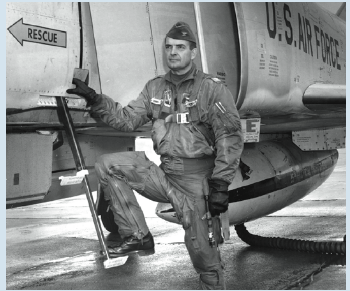
1972 Fighter Pilot, General David Jones