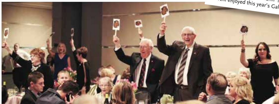
Heads or tails? These lucky Gala guests were still standing after the first couple of rounds! The winner of the heads or tails game won a Red and Green Beaver Booster membership!