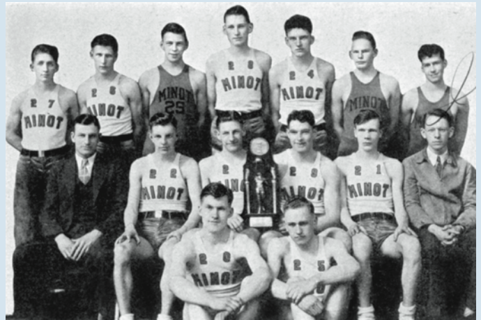
Minot High School 1935 State Basketball Champions.