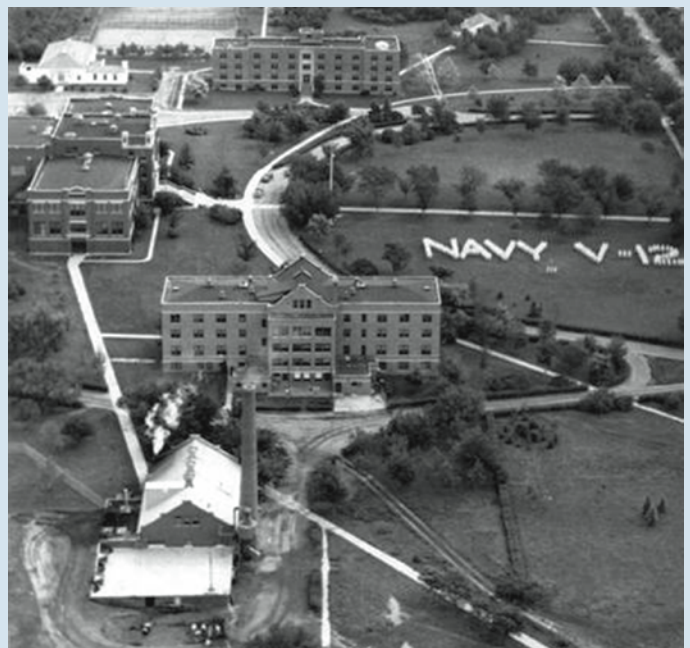
A bird's-eye view of Minot State Teachers College and the Navy V-12 logo formed by cadets in the ellipse.