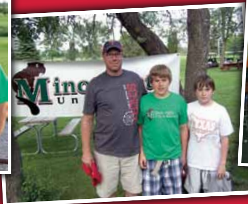
Second-place team in Stanley.