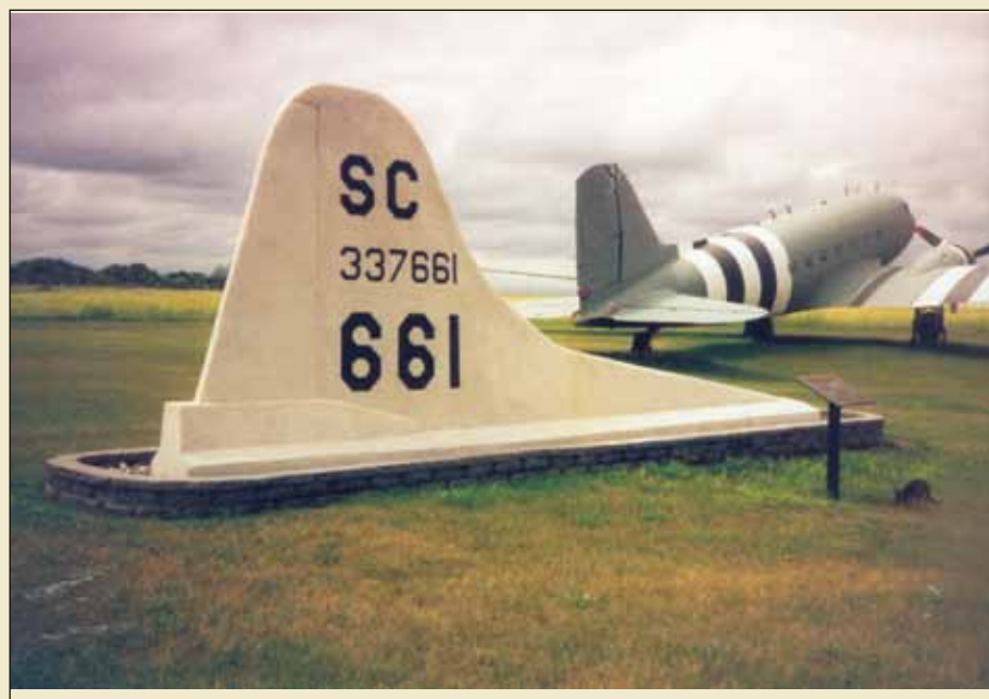
The B-17 tail monument honoring AAF airmen killed in World War II at the Dakota Territory Air Museum near the Minot International Airport.