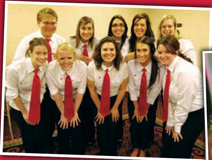
MSU students helping out at the 27th-Annual GALA.