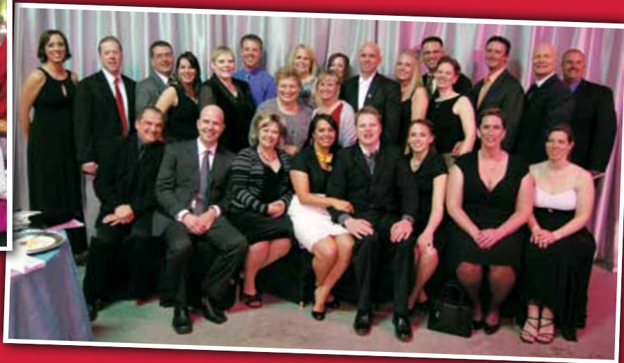
Prudential Preferred Properties representatives enjoying the GALA.