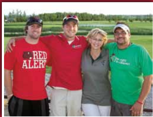
First Summer Golf Tour stop in Velva.