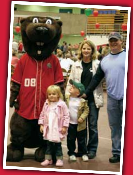
Over 1500 people enjoyed the Community Block Party!