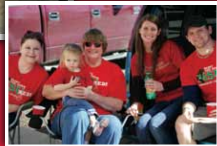
Enjoying the Homecoming Tailgating!