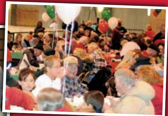
Alumni & Beaver Booster Appreciation Night 2011