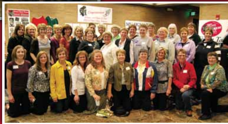
All women's athletic teams and the 1987 women's track and field team were recognized during the 2010 Homecoming.