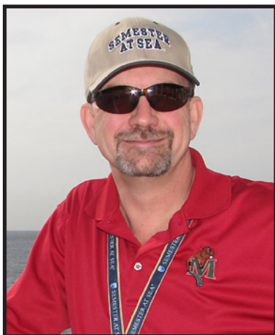
Girard on previous SAS journey

Hey students, do you feel like you can't fit the traditional semester-long Semester at Sea® experience into your life right now? Well, there is another option for you!