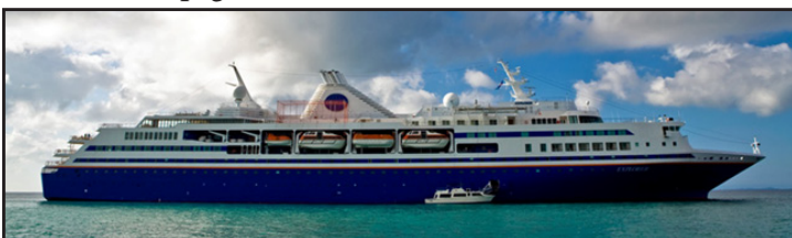
The MV Explorer, a floating university