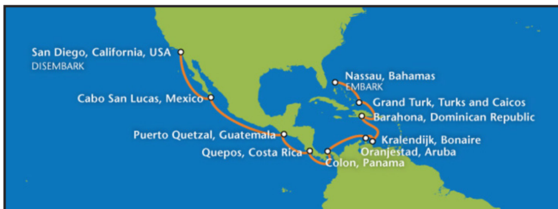
The "Doing Business in Latin America" Study Tour's Ports