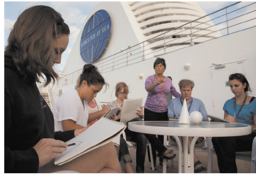
Studio art class on the deck of the MV Explorer.