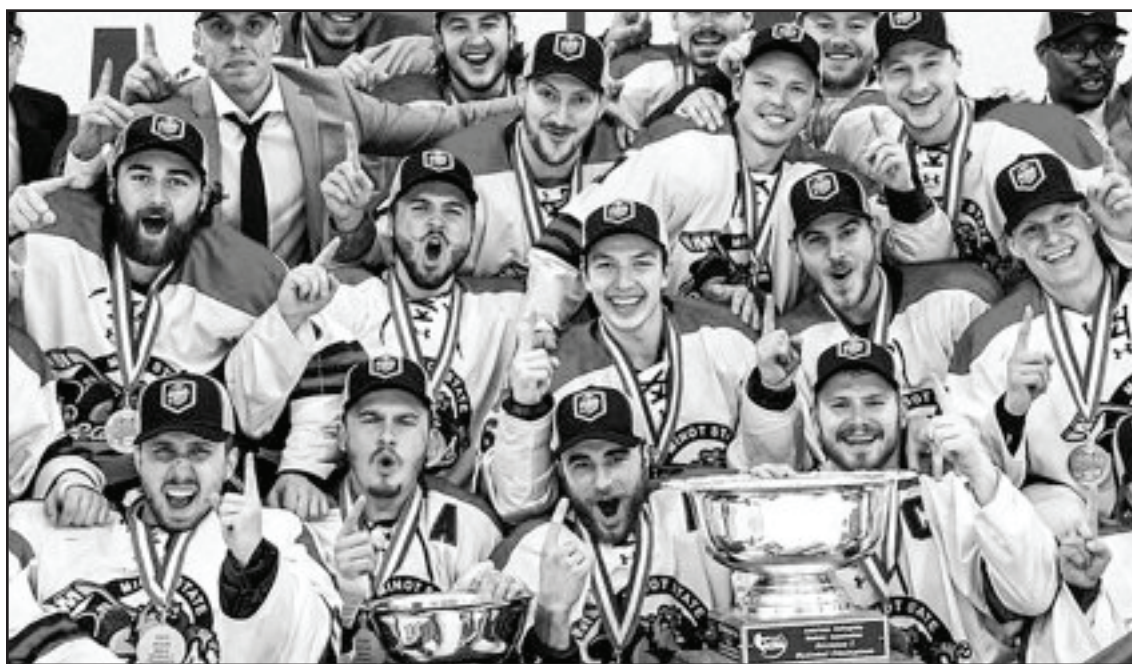
MSU Men's Hockey begin their title defense as reigning ACHA National Champions this fall.

The Minot State Men's hockey team will be having their home opener on September 29th where they compete against Liberty University on that Friday and Saturday. During that weekend, the men's team will be having their 2023 National Championship banner raised. "By raising that banner in front of everyone will be such a special night not only for us but also for the fans."