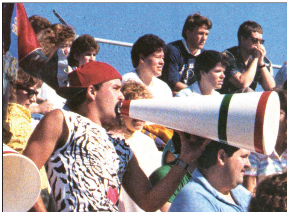
MSU in the 80's