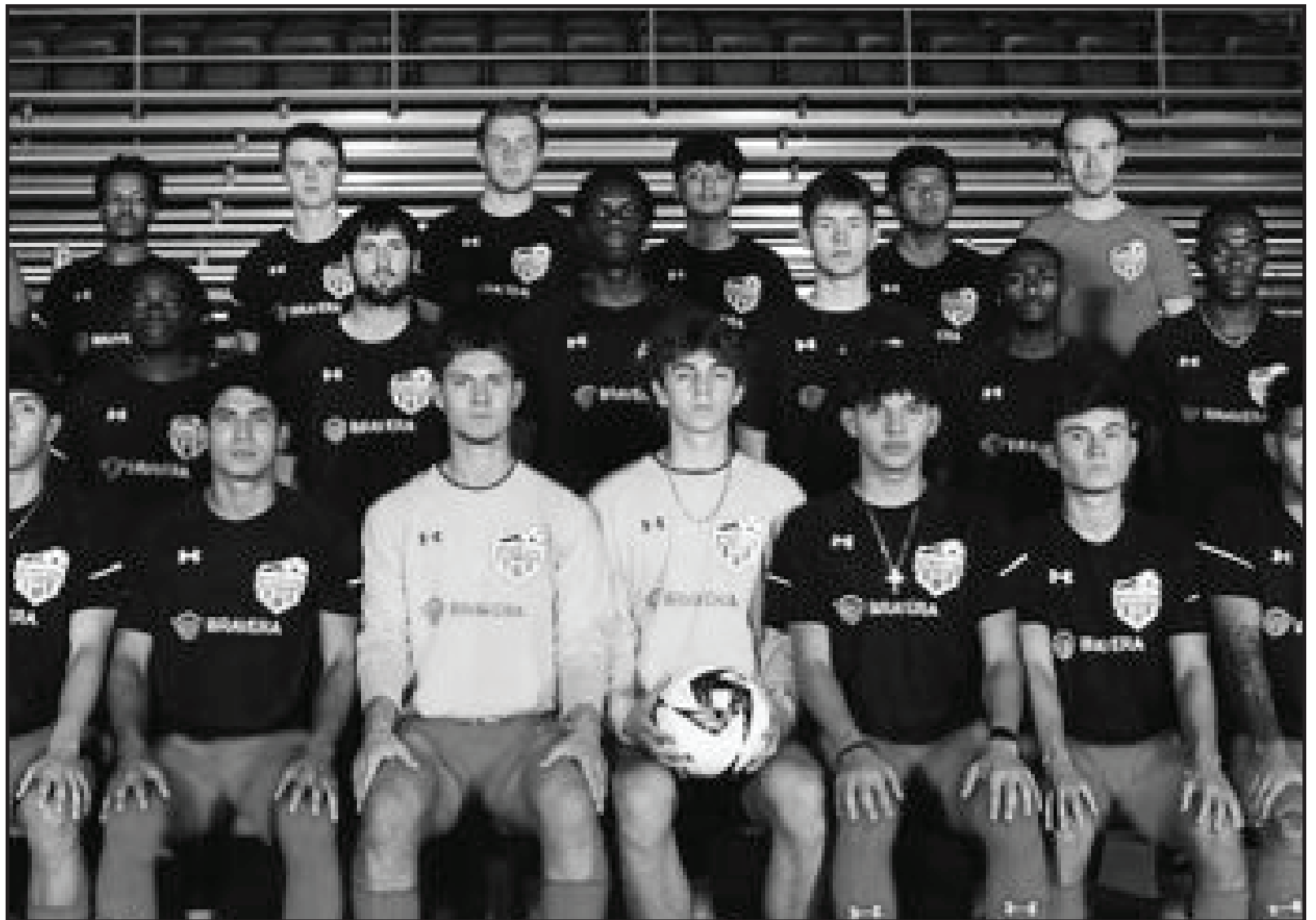
Minot State's newest club sport team, MSU Men's Soccer, debuted this fall at Herb Parker Stadium.

a great victory over NDSU who were the 8-time champions in the conference. Their hard work and dedication to the team and the sport drove them towards victory.