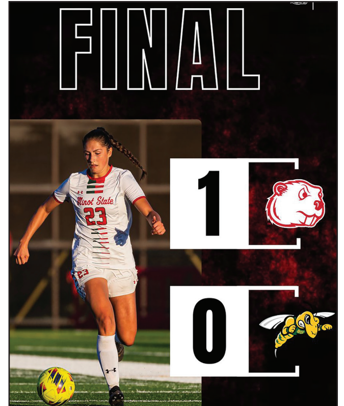
MSU Women's Soccer earns a 1-0 Victory over MSU-Billings.