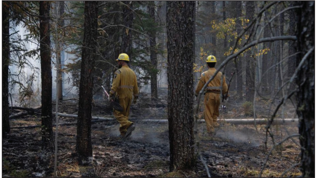
Firefighters in Canada

It is important for Minot State students to become aware of this issue, and hope for the best in the next months to come.