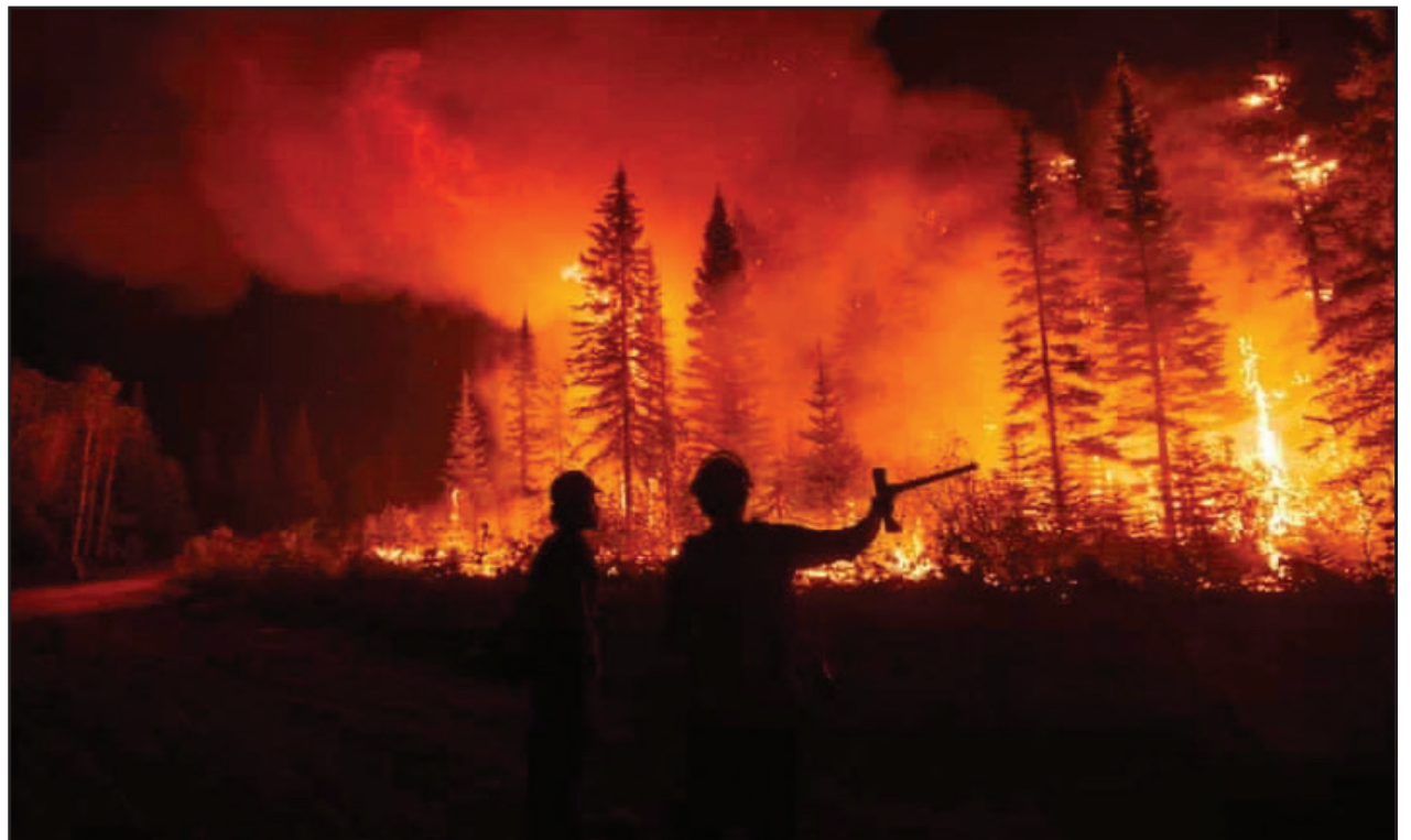
Fires raging in Canada